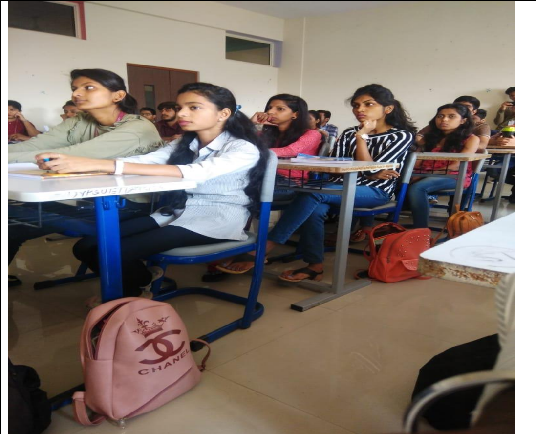
Participated Students, while explaining “ Computer Hardware & Networking ”.