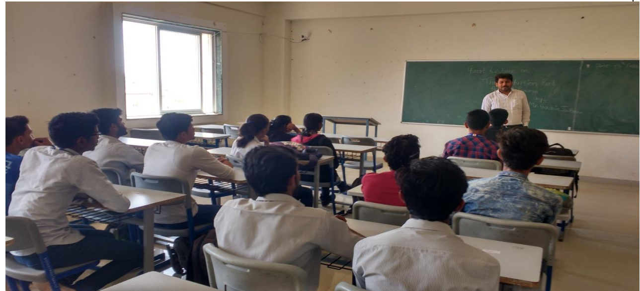
Introducing production part approval process

This lecture attended by total 24 no. of students SY & TY Mechanical from DYP