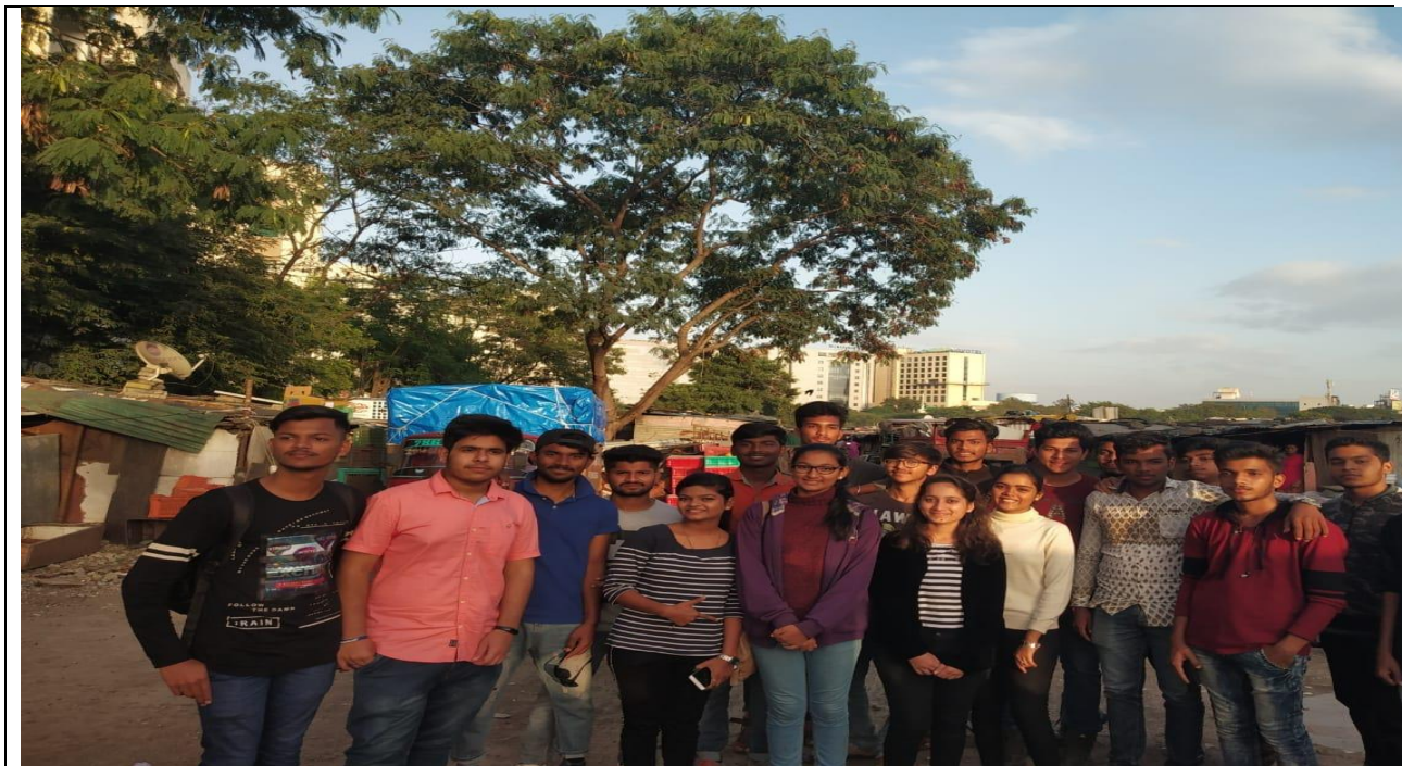
Participated Students, in “Robin Hood Army”.