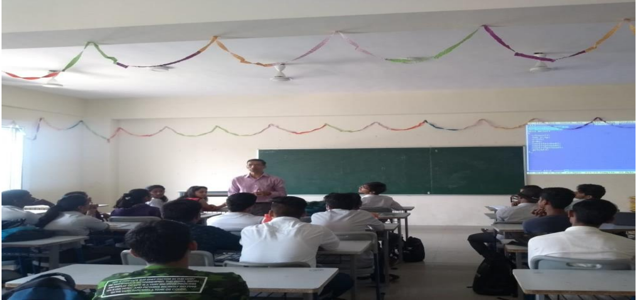
Participated Students for Expert Lecture