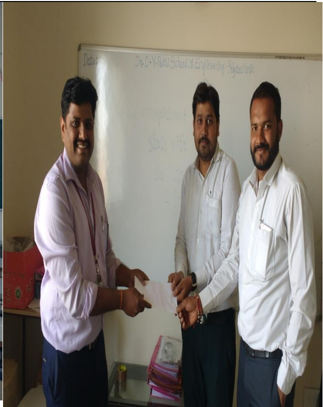
Question answer session and felicitation with letter of thanks