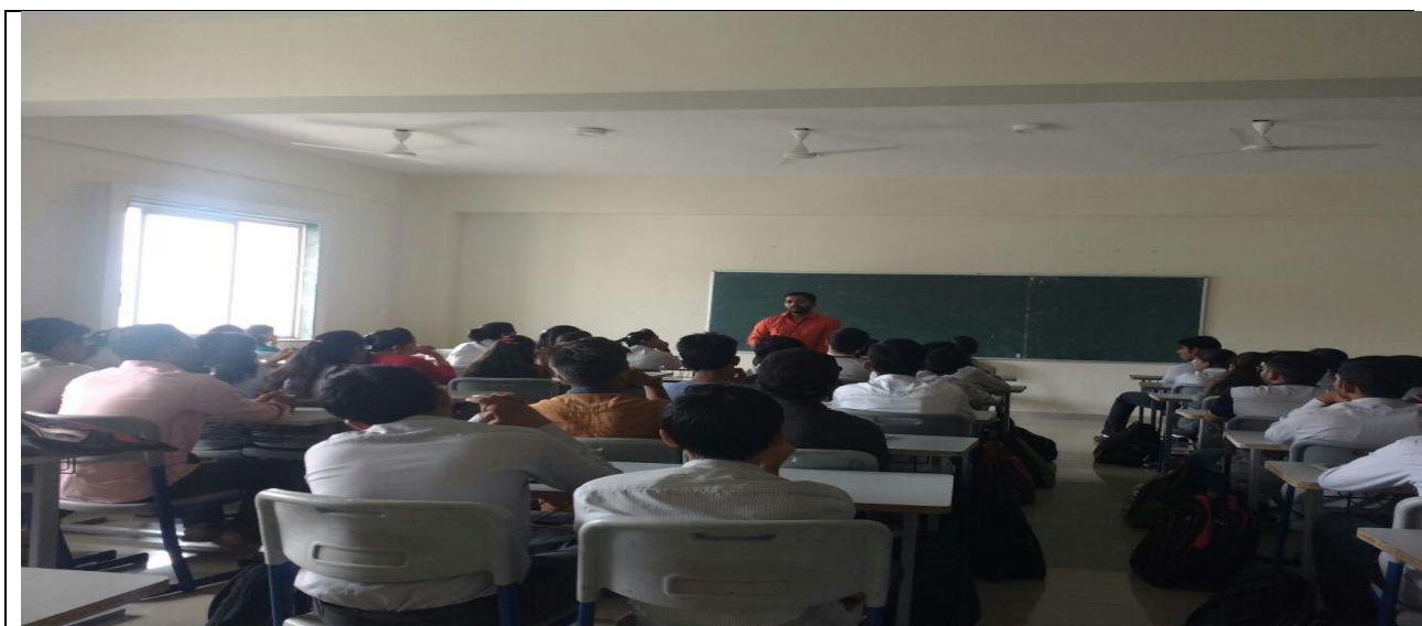
Participated Students, while explaining “ Personality Development ”.