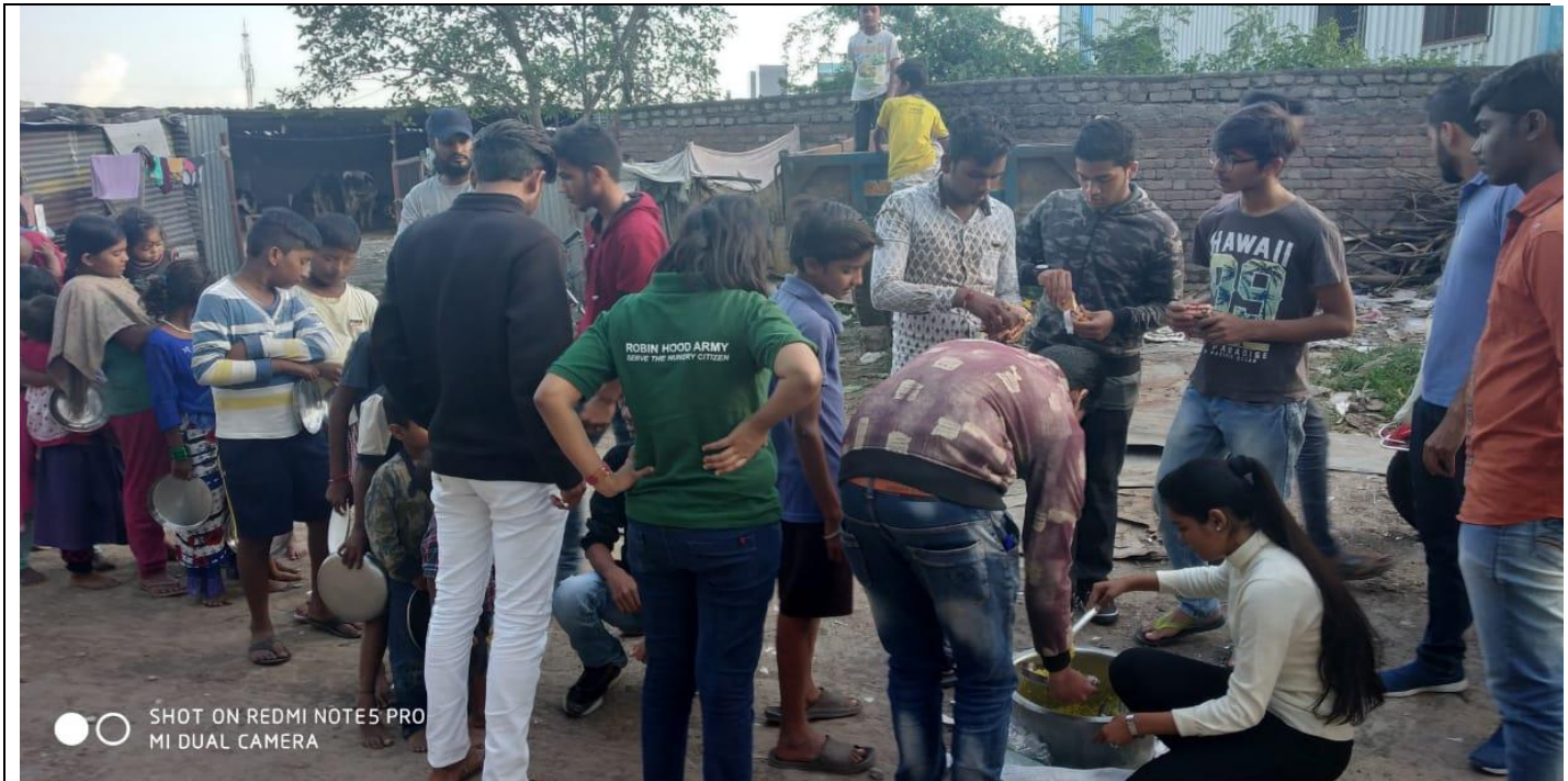
Participated Students, in “Robin Hood Army”.

“Robin Hood Army” Social activity held in viman nagar near nexa showroom.