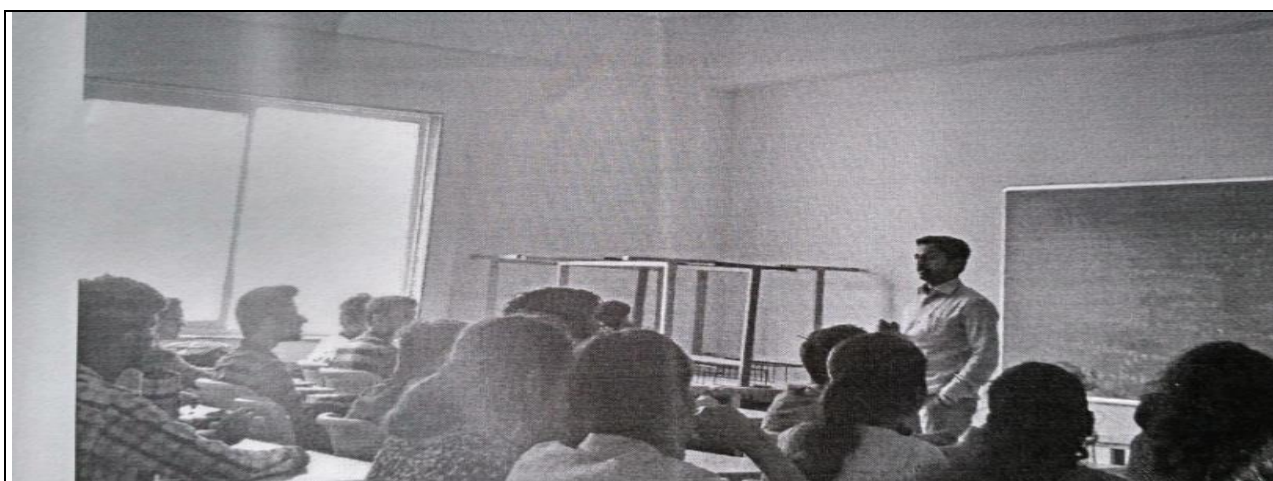
Question & Answer Session, while explaining “Personality Development ”.